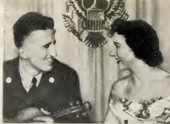
Arlene Francis, G.I. on Talent Patrol .